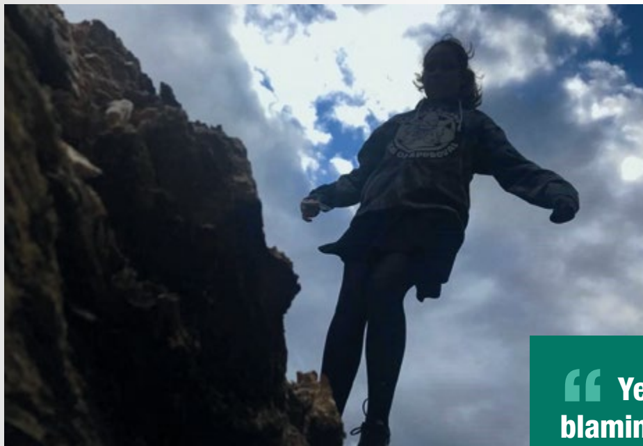
AYPH photography competition winner 16-19 category

“ Yeah, I was blaming myself and then people were coming up saying, ‘You wanted it, you did this, you did that’, so it was making me feel more, ‘Maybe it was my fault’. ”